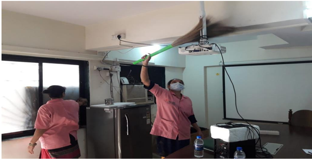
1.8 Snaps during Cleaning