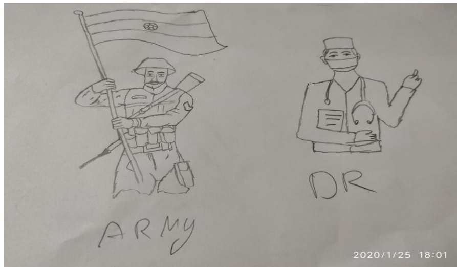
1.7 Sample of students drawing