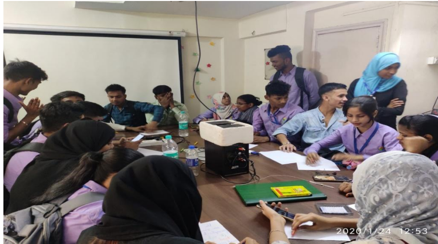
1.6 Snaps of Students while drawing