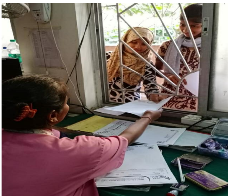
1.5 Receptionist giving free case paper to the girls.