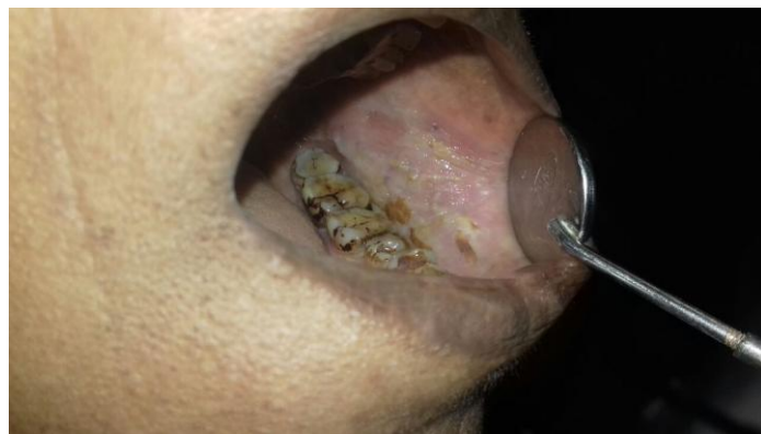
Picture 2 : Dr Vaishali checking patients. Picture 3 : White patches in one of the patients.